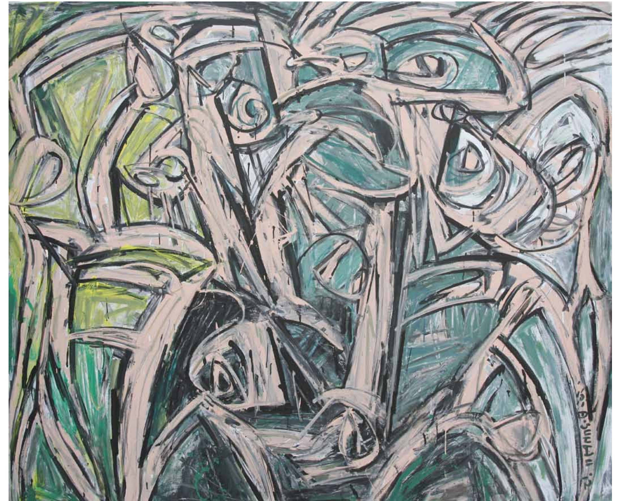
Vitality of the Jungle 2012, acrylic on canvas, 63¾ x 76¾ inches

FRIEDMAN & VALLOIS 15 TH MARCH - 20 TH APRIL 2013