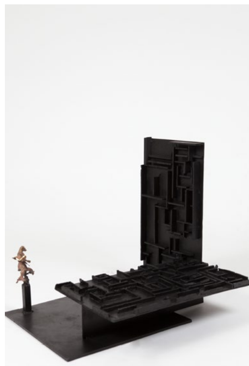
The Labyrinth, 2014 Patinated bronze Edition 8 + 4 20 1/8 x 30 2/3 x 22 2/3 in 51 x 52,5 x 57,5 cm