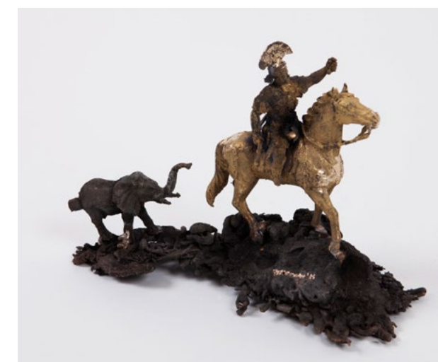
Hannibal crossing the Alpes, 2015 Patinated bronze Unique piece 7 1/2 x 4 7/3 x 11 5/8 in 19 x 11 x 29,5 cm