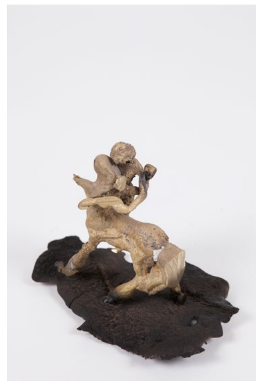
The rapture, 2014 Bronze and painting Unique piece 7 7/8 x 4 1/3 x 5 1/8 in 20 x 11 x 13 cm